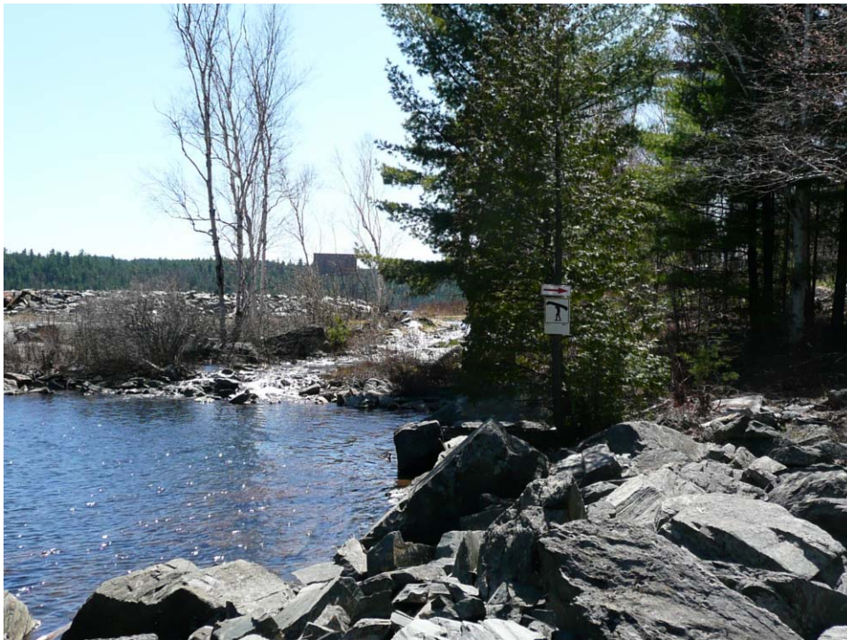
Fast water on the Chiniguchi River at the North Matagamasi Dam

I wondered about the cost of all those signs and the intellect of the bureaucrat who had placed them. Clearly an example of our tax dollars at work, protecting us from our careless ways.