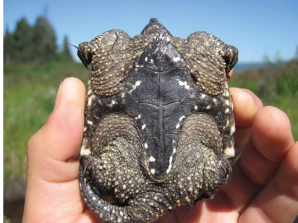
Notice the small lower shell of this young snapping turtle.

Few data are available on how many snapping turtles are taken in Ontario each year or how large populations are. Huge portions of their natural habitat have disappeared – over 70% of southern Ontario's wetlands are gone. As well, large numbers of snapping turtles are known to be killed on roads every year. These factors, in combination with the snapping turtle's low reproductive rate, make it clear that this species cannot be sustainably hunted.