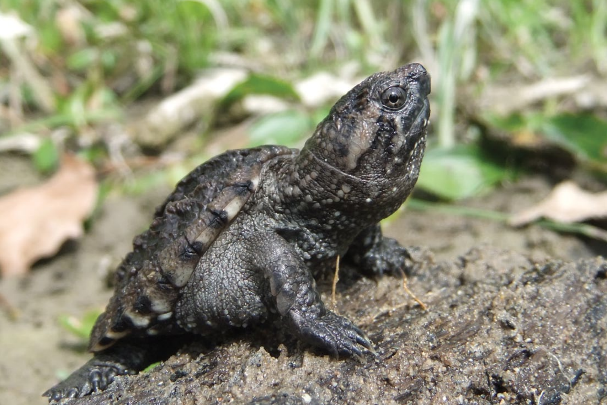
Above: Hatchling snapping turtles, like this one, are approximately the size of a toonie. Right: A snapping turtle laying her eggs at the side of the road in the City of Kawartha Lakes. Cover: Adult male snapping turtle in Algonquin Provincial Park.