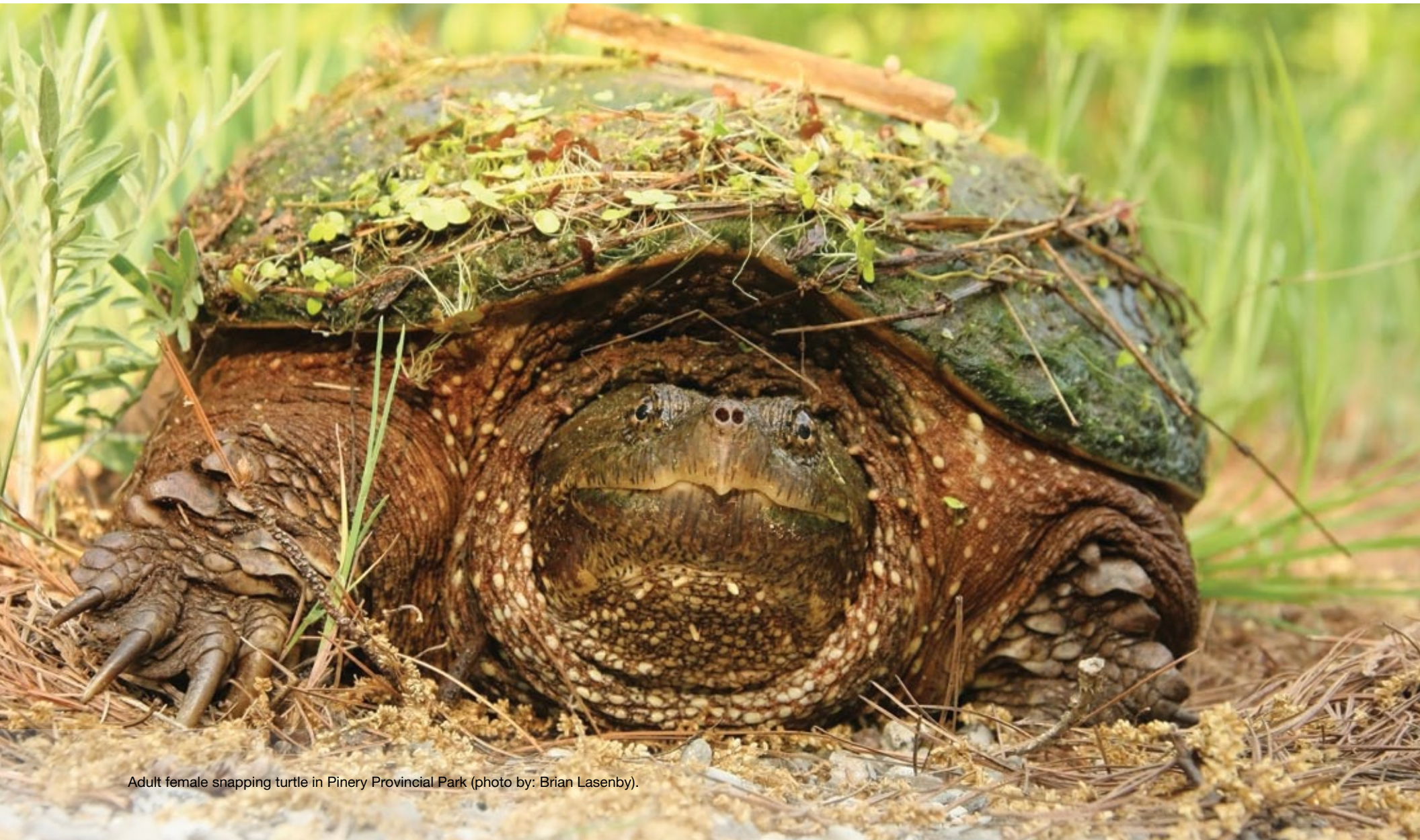
Adult female snapping turtle in Pinery Provincial Park (photo by: Brian Lasenby).

had a mercury level close to the unsafe limit for women of child-bearing age and children under 15. However, the presence of mercury in the bodies of every turtle tested suggests that they – and humans – depend on contaminated water systems, and that the health of humans and turtles alike may be at risk as a result. Hunting and eating turtles, of course, magnifies the risk of humans being contaminated.