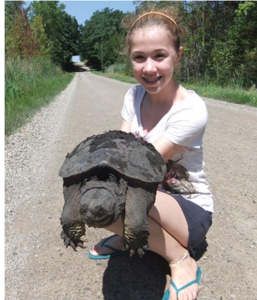
A young lady happily helping a large snapping turtle off of a road.